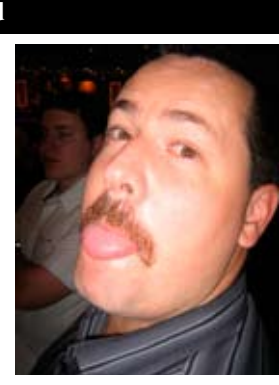
Club Man?? More like Porn Man